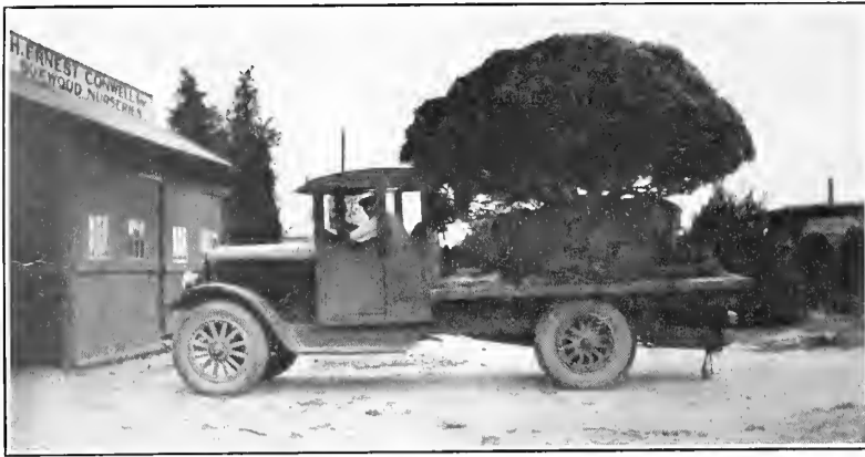
LARGE SUFFRUTICOSA SPECIMEN OF PERFECT FORM BEING MOVED IN NURSERY IT'S HERE NOW!